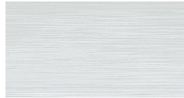
FLUSH PANEL WITH WOODGRAIN EMBOSSMENT