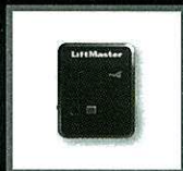
Remote Light Control (Model 825LM)

The Chamberlain Group, Inc. 845 Larch Avenue Elmhurst, IL 60126 www.LiftMaster.com