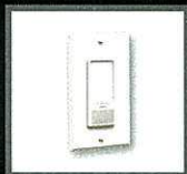
Remote Light Switch (Model 823LM)